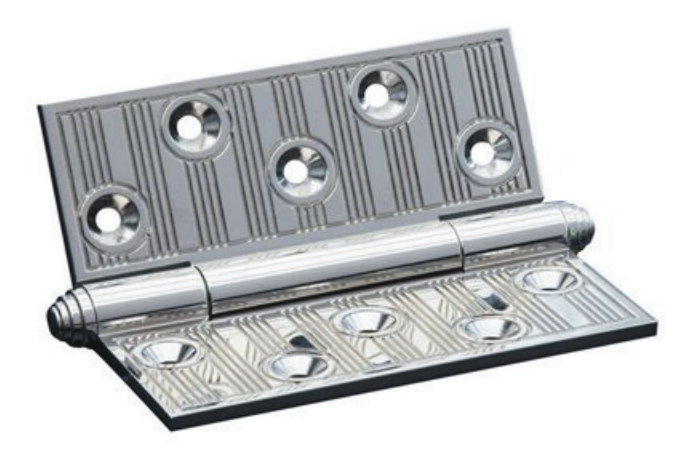
Finish - Shown in Polished Chrome | Available in all Henry Blake Hardware finishes

Product Code: SK5108F | Product Name: Art Deco Finial Door Hinge