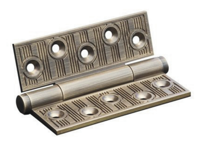
Finish - Shown in Antique Brass | Available in all Henry Blake Hardware finishes

Product Code: SK5108 | Product Name: Art Deco Door Hinge