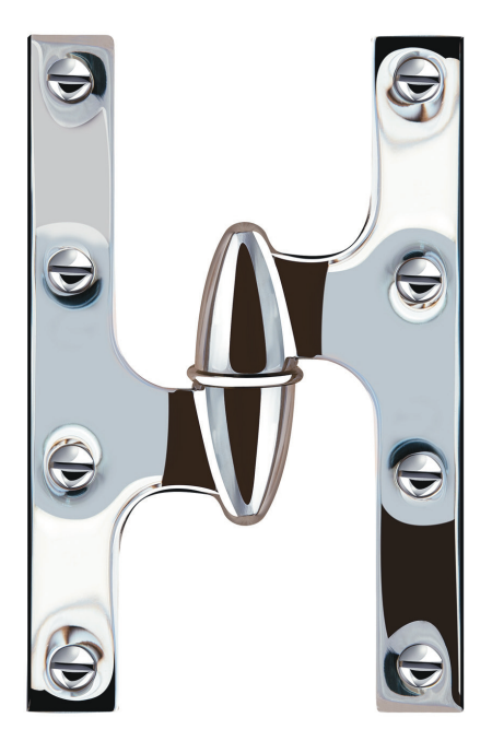
Finish - Shown in Polished Chrome | Available in all Henry Blake Hardware finishes

Product Code: SK5106 | Product Name: Olive Knuckle Hinge