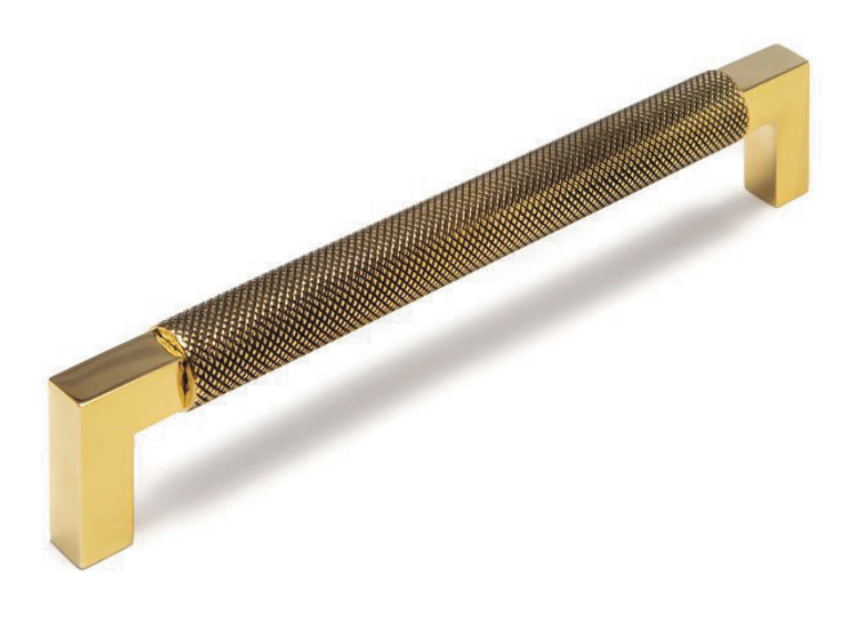
Finish - Shown in Polished Brass Unlacquered | Available in all Henry Blake Hardware finishes

Product Code: SK3800 | Product Name: Knurled Bauhaus Cabinet Bar Handle