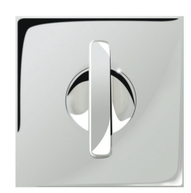
Finish - Shown in Polished Chrome | Available in all Henry Blake Hardware finishes